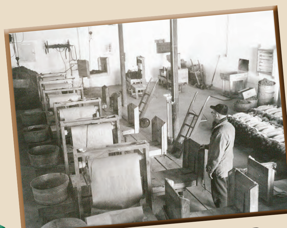
Packing Room at New Kent Nursery, Dec. 1958