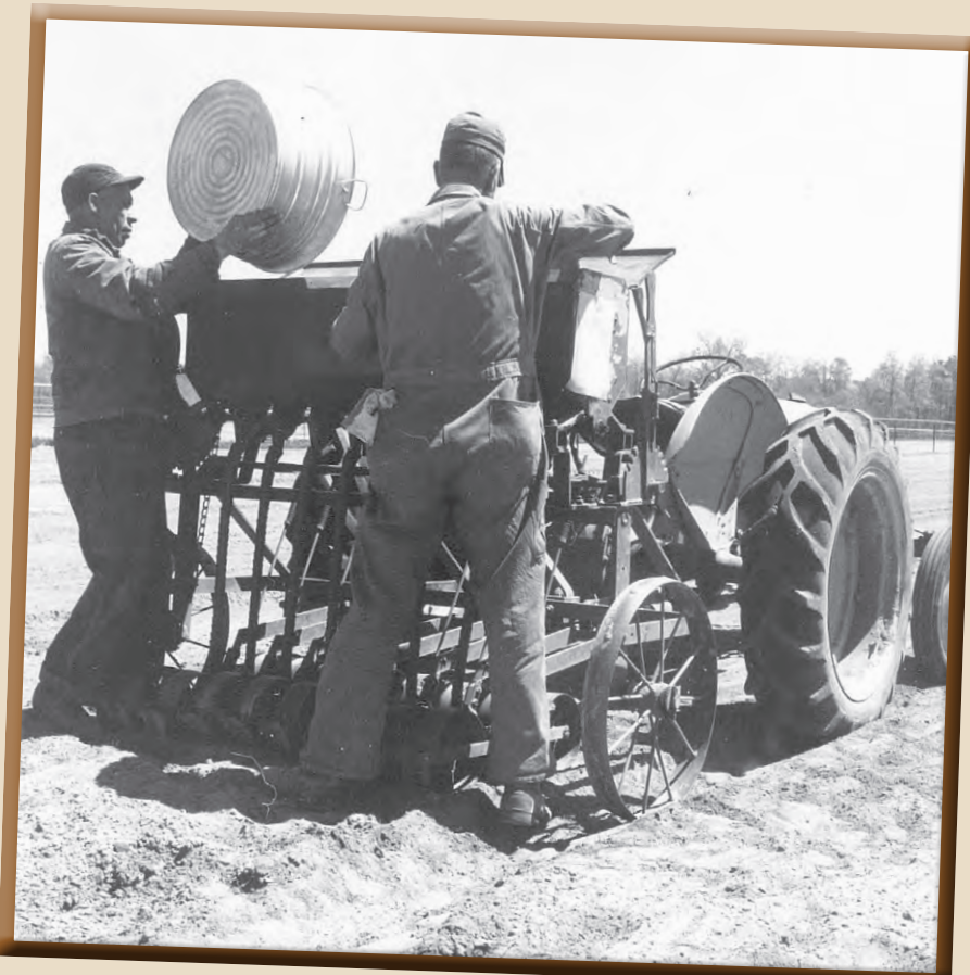
Sowing Seed at New Kent Nursery, 1960