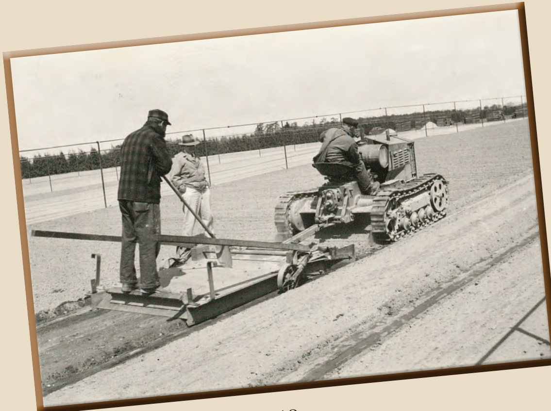
Seedbed Shaper, circa 1948