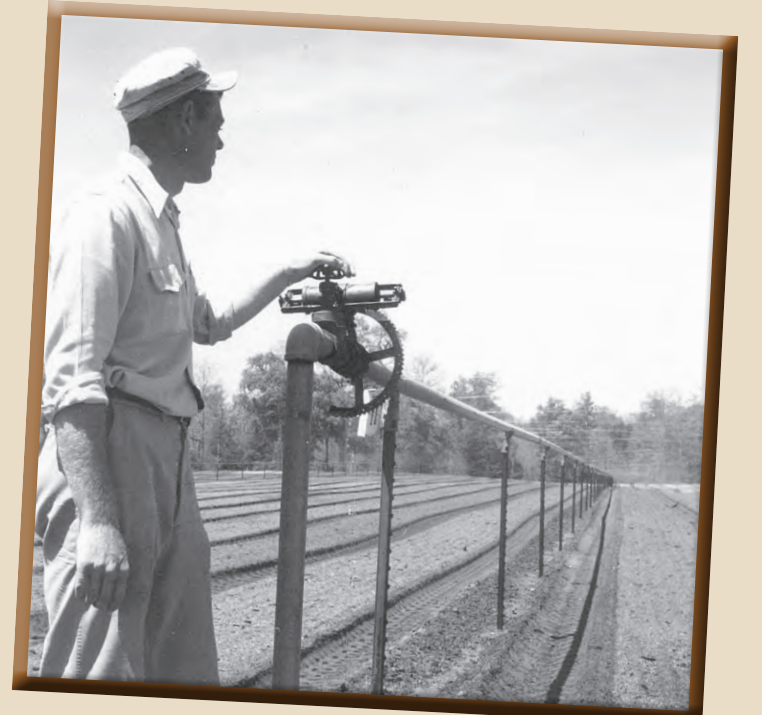
Sprinkler System in Operation at New Kent Nursery, 1960