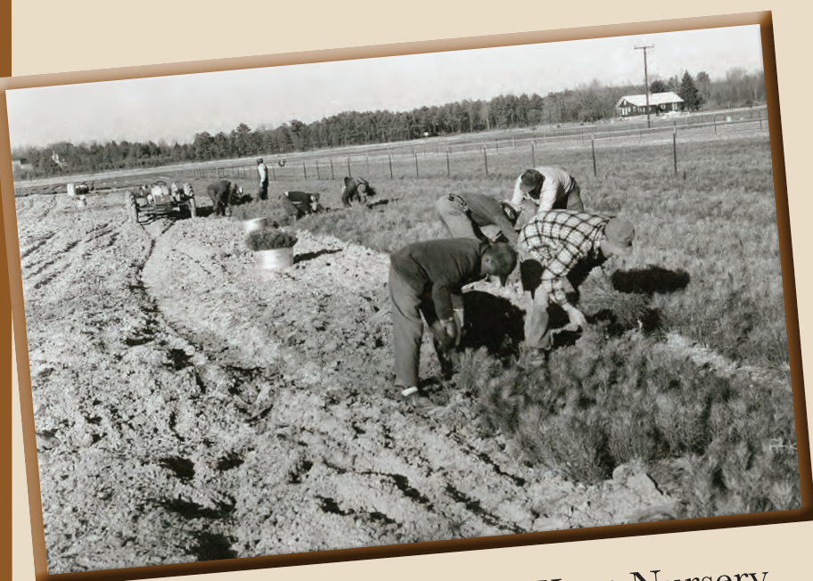
Lifting Loblolly Pine at New Kent Nursery, Nov. 1955