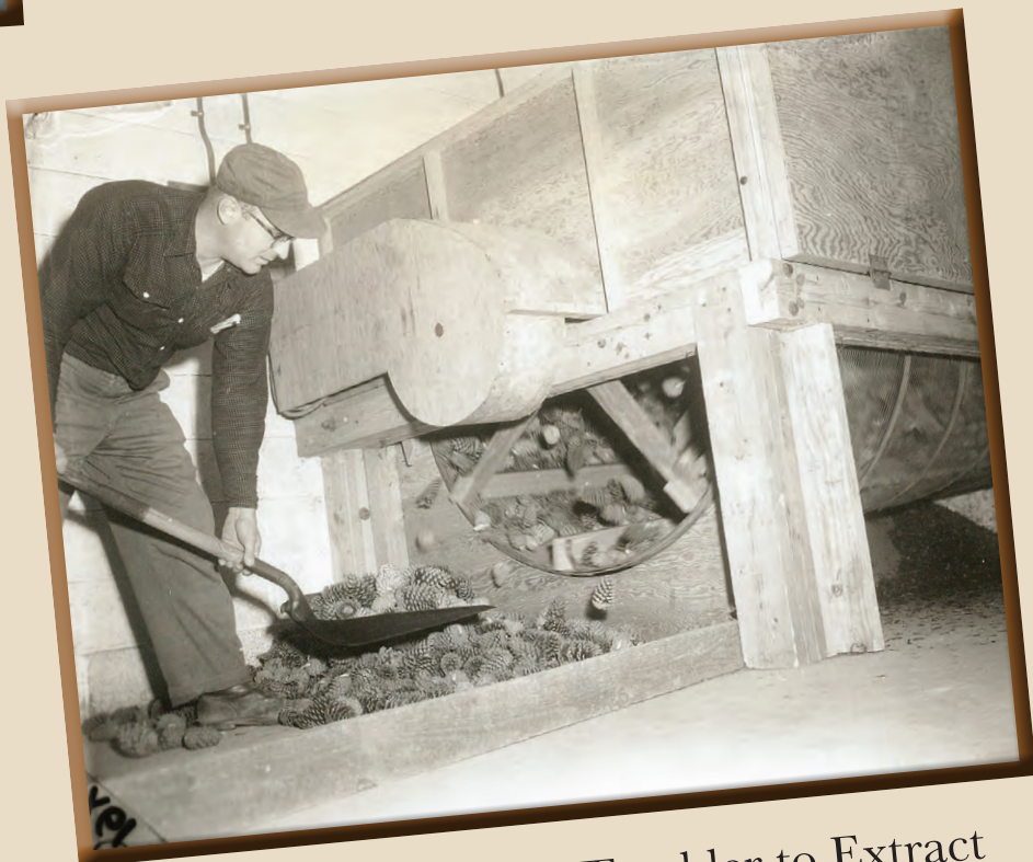
Feeding Cones into the Tumbler to Extract Seed at New Kent Nursery, Nov. 1955