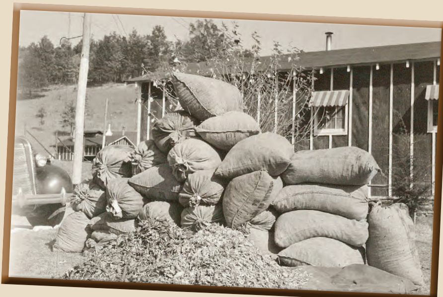
Camp Collected 800 lbs. of Poplar Seed at Clintwood in Dickenson County, Nov. 1939