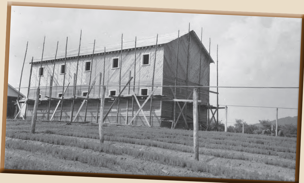
Charlottesville Nursery Cone Building used for Drying Pine Cones and Extracting Seed, circa 1952