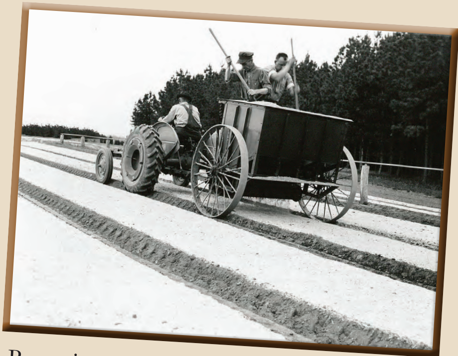
Preparing the Seedbeds at the Charlottesville Nursery, 1953