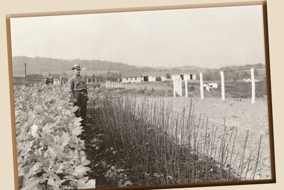
Tulip Poplar and Walnut Seedbeds at the Charlottesville Nursery, 1938