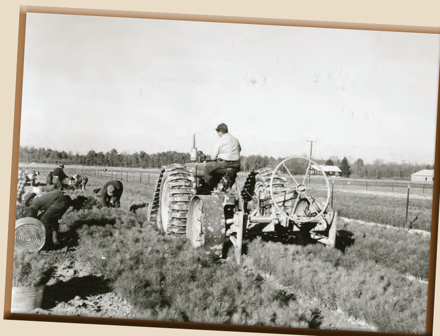
Lifting Loblolly Pine at New Kent Nursery, Nov. 1955