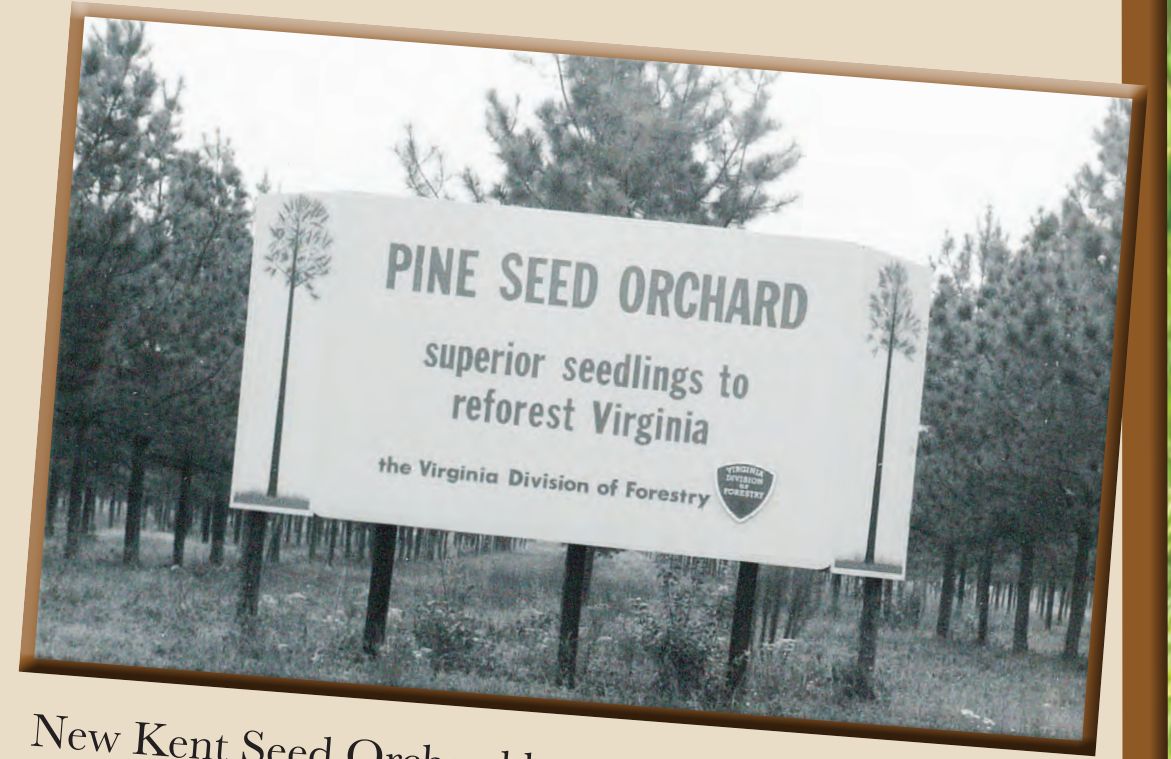
New Kent Seed Orchard located in Providence Forge, Virginia, 1981