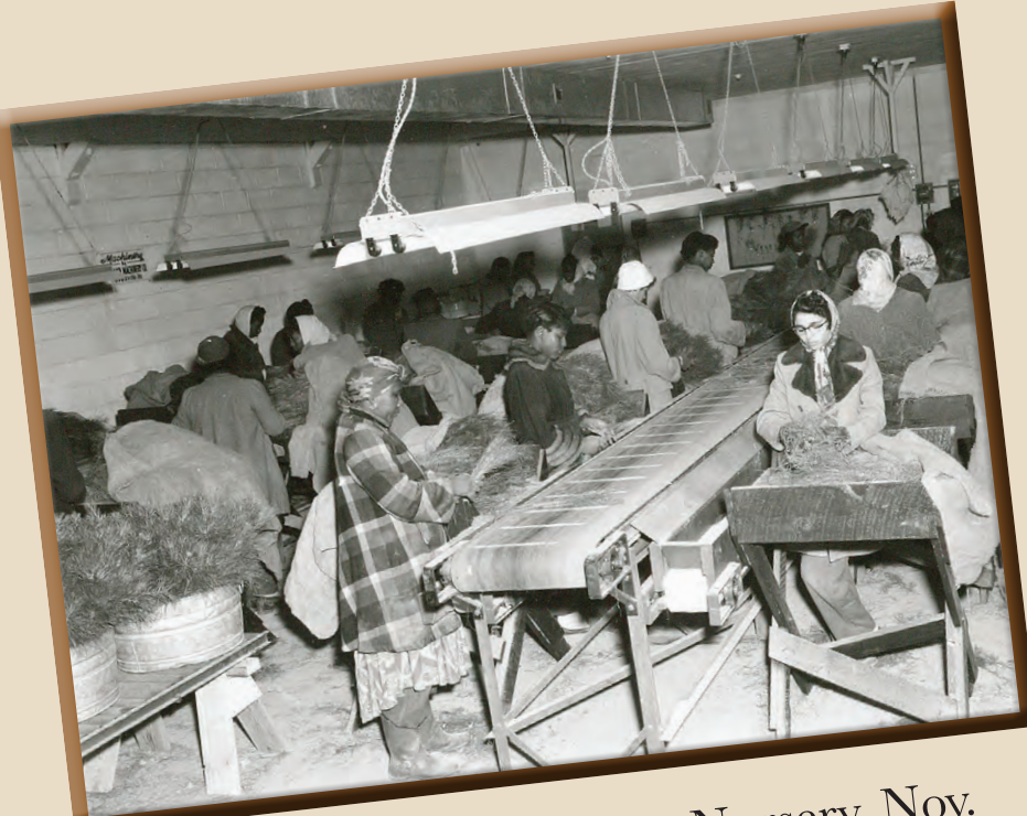
Grading Trees at New Kent Nursery, Nov. 1955