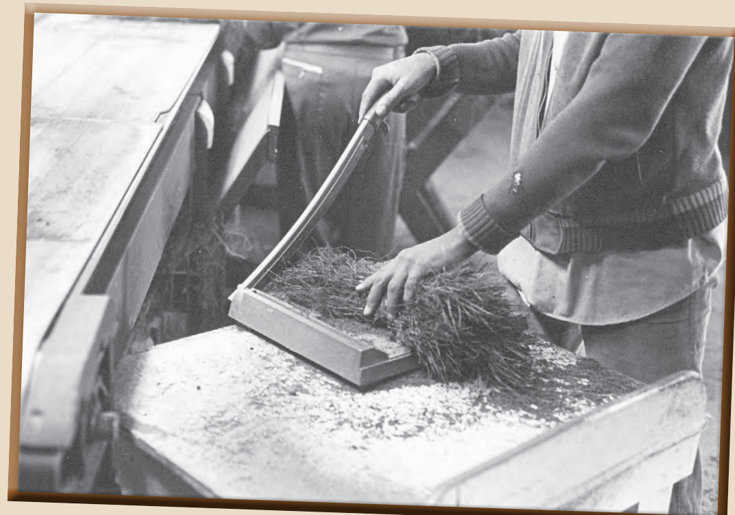
Root Pruning Seedlings