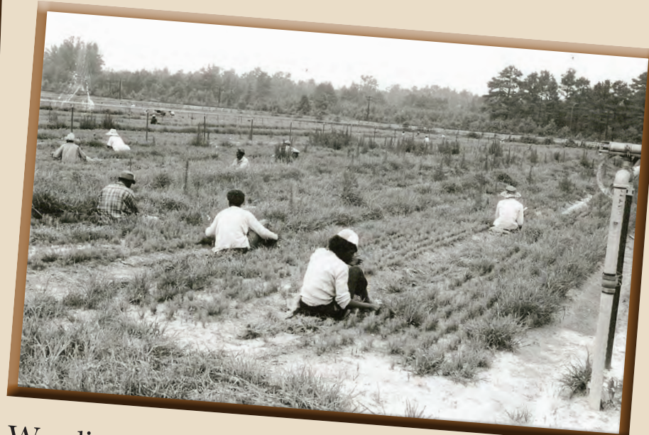
Weeding the Seedbeds at New Kent Nursery, Aug. 1956