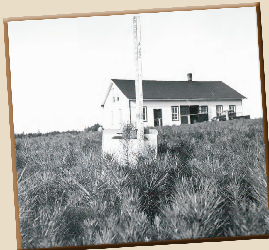
Charlottesville Nursery, Dec. 1956