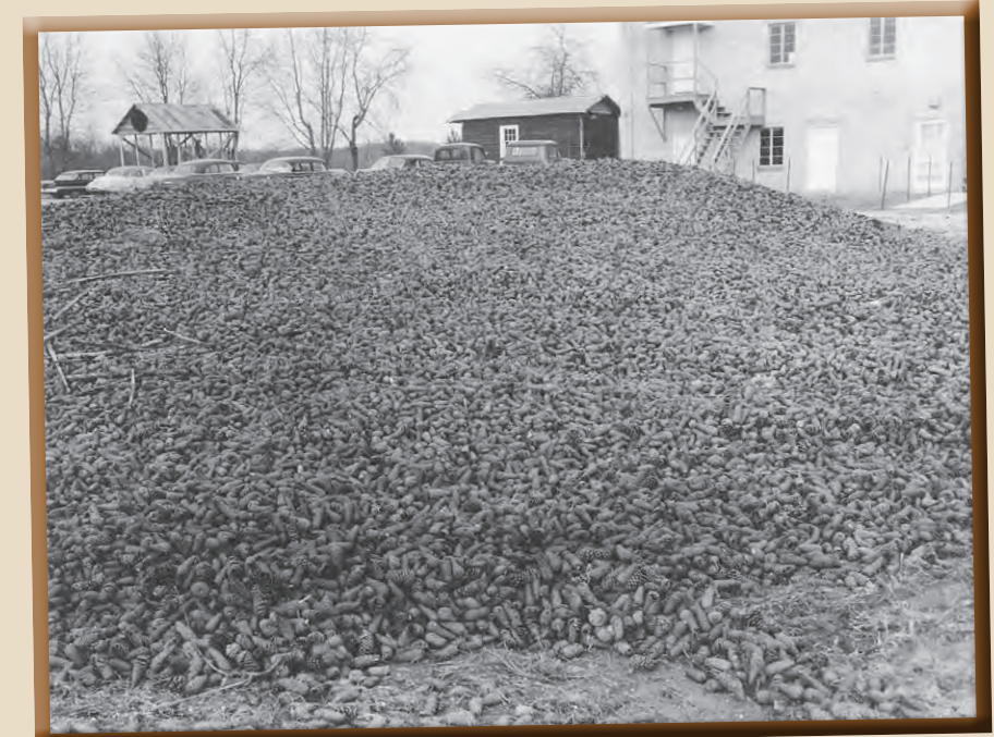
Cones Piled on the Grounds, May 1959