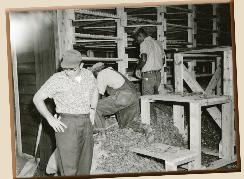
Cone Drying at New Kent Nursery, Oct. 1955