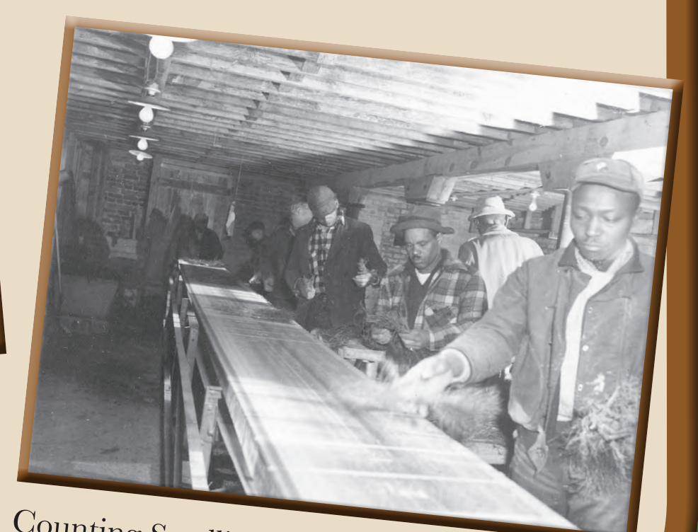
Counting Seedlings at Peary Nursery, Feb. 1951